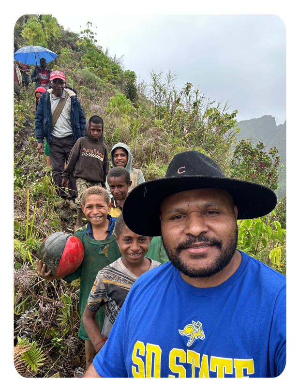
On our way to carry lumber