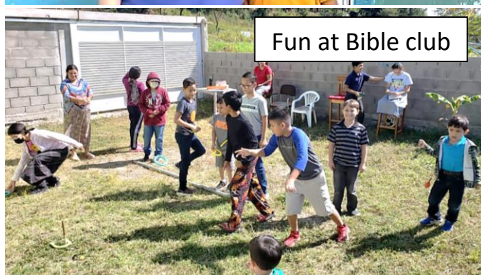
Fun at Bible club