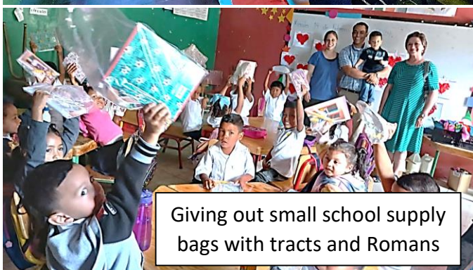
Giving out small school supply bags with tracts and Romans