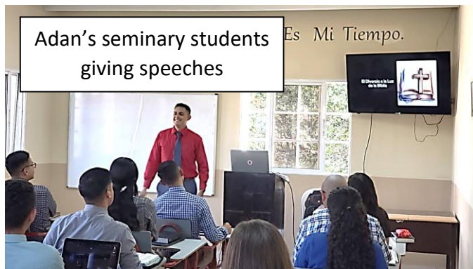
Adan's seminary students giving speeches