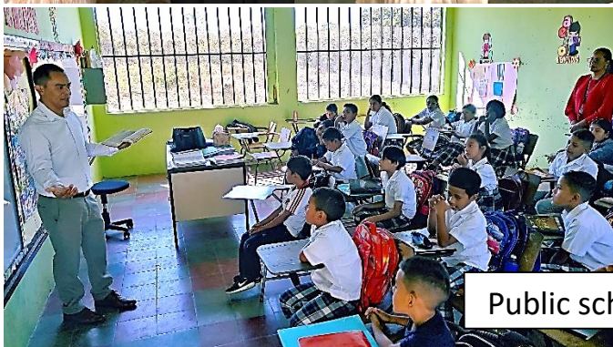
Public school ministry