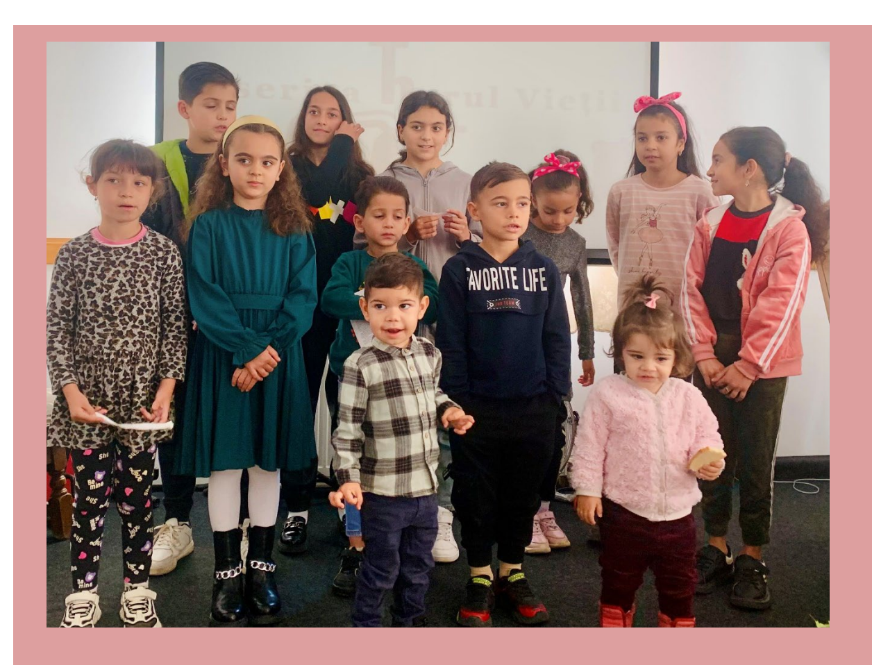
The children's Thanksgiving program

We also praise the Lord for our children's ministry and the families bringing their young children to church! Having a nursery for young children doesn't yet fit the culture in our little village, so we do church with them. It sometimes brings distractions but mostly joy and blessings watching these young children grow in grace and learn to praise the Lord with us. It also helps us adults practice patience, tolerance, and temperance.