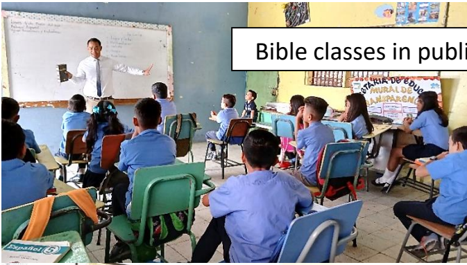
Bible classes in public schools