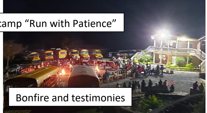
Bonfire and testimonies