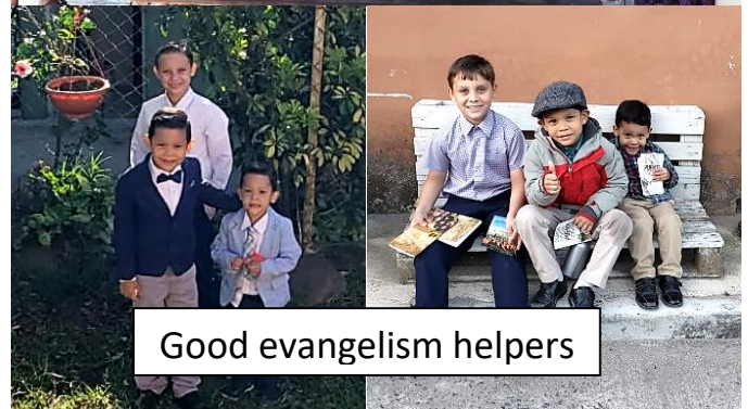
Good evangelism helpers