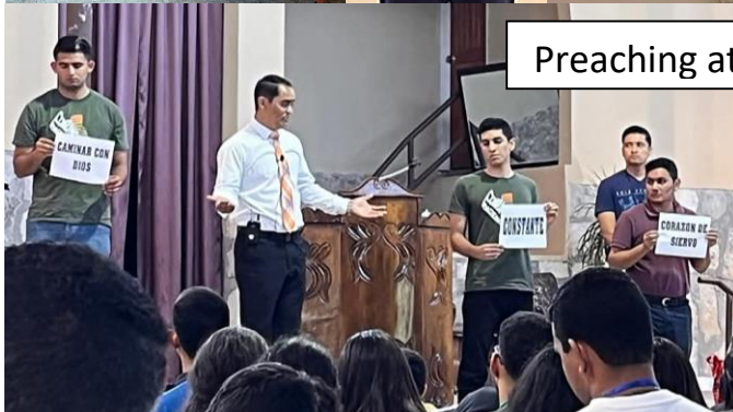
Preaching at camp