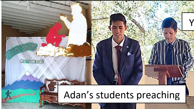
Adan's students preaching