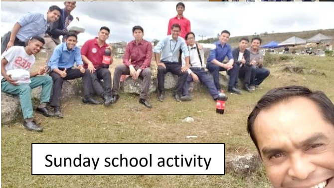
Sunday school activity