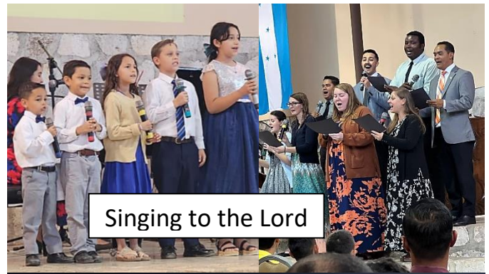
Singing to the Lord