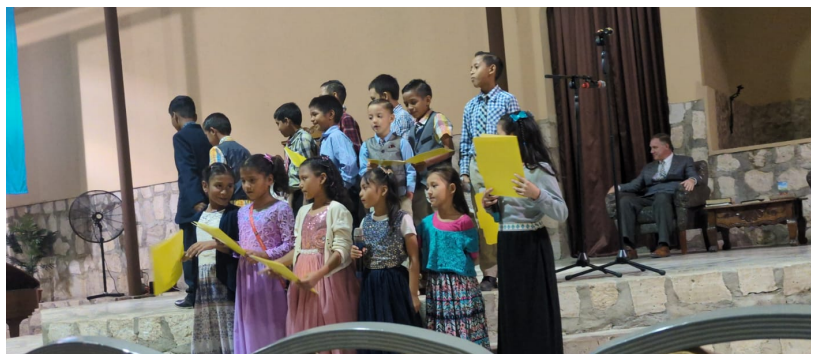
Some children from the younger academy singing for the church