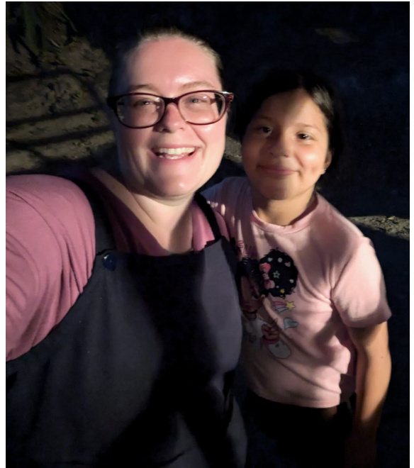
One of my students

A guest speaker talking in one of our Sunday school classes. Praise the Lord for several ladies' salvation!