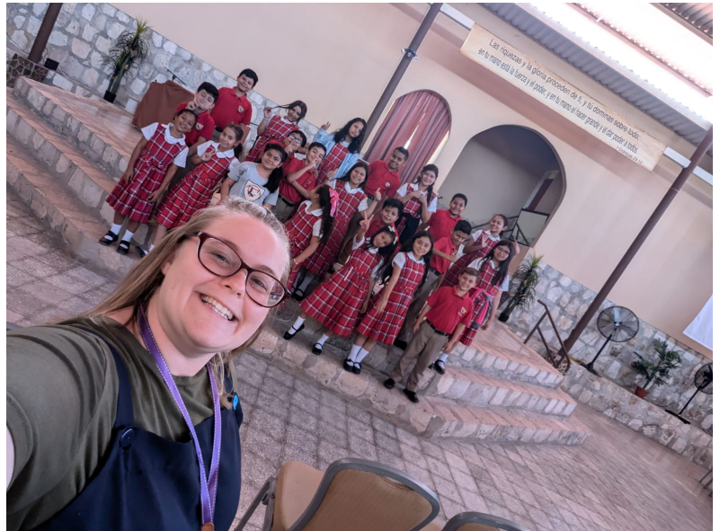
My class and I practicing for the Easter program.