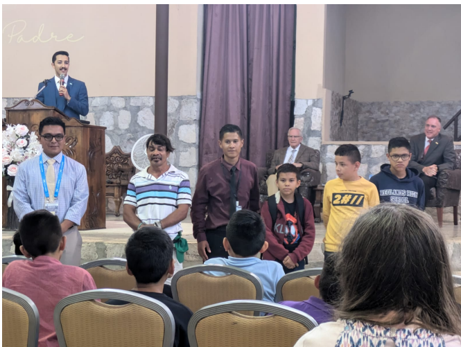
These are several people who were saved at church.