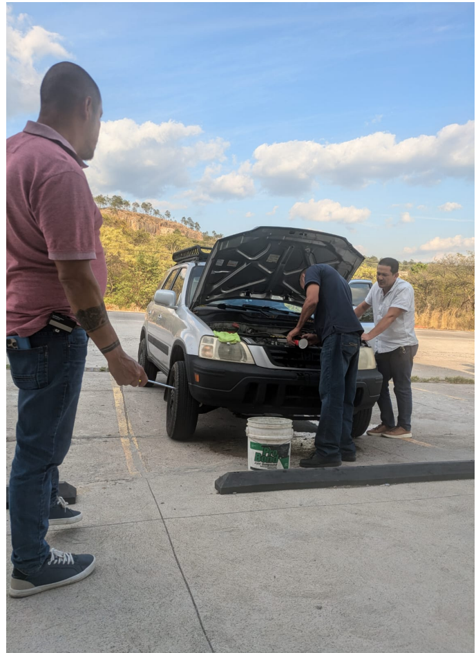
My car needs lots of prayer!