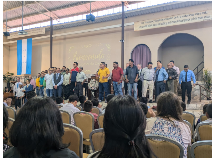
All the fathers in the church