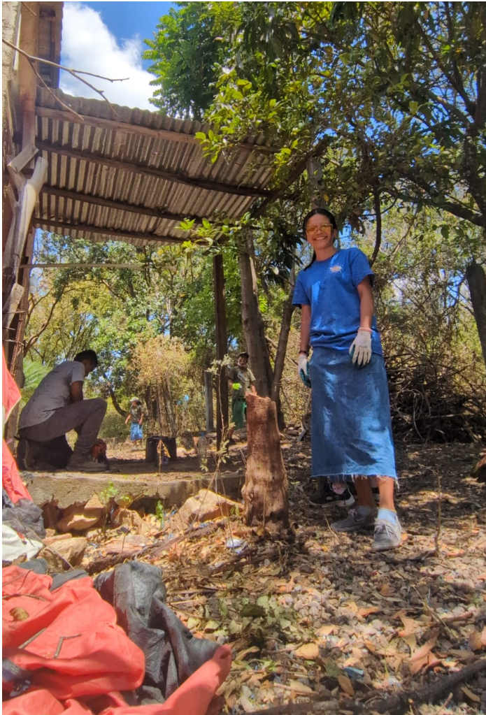
Workday at the new girls' home