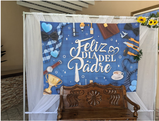
Hondurans celebrate Father's Day on March 19.