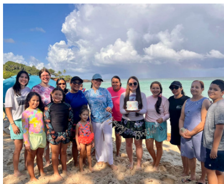
Best beach day yet!