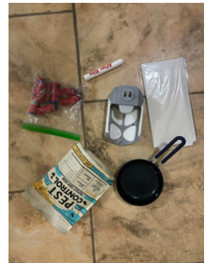
All the bug gadgets we brought back here