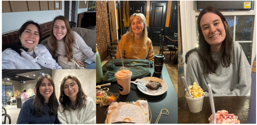
Time with friends at home