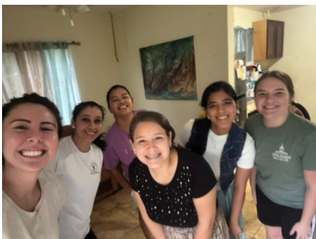
Teacher workout session at home