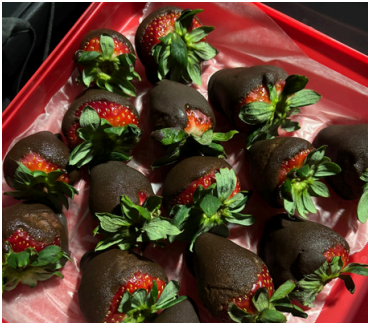
Delicious welcome home gift