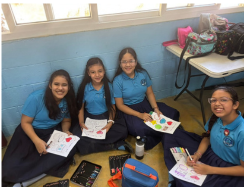
First day back to school in 2026!