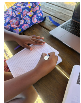
Lessons with Britannia