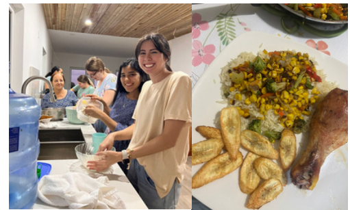
First time making tajadas and baleadas!