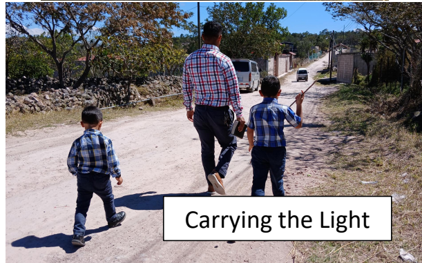
Carrying the Light