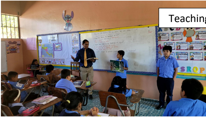
Teaching God's Word