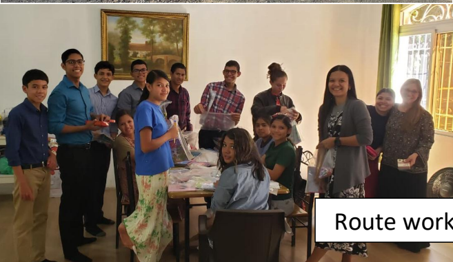
Route workers meeting