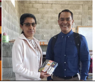
Giving school supply packets to teachers