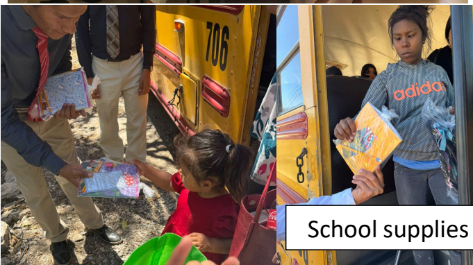
School supplies day on the bus