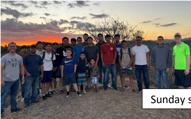
Sunday school guys camp-out