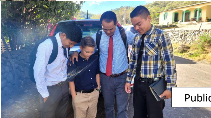
Public school ministry