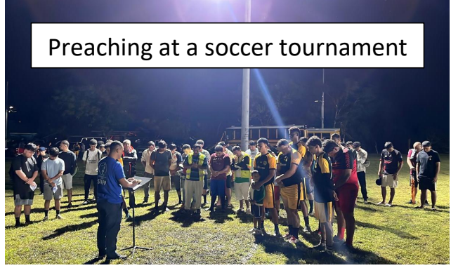
Preaching at a soccer tournament